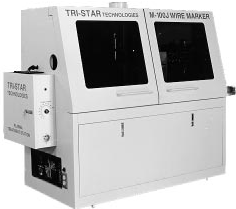
M-100J Ink Jet Wire & Cable Marker

T he M-100J is a fully automatic, computer controlled, high speed ink jet wire and cable marking system. This new and unique wire processing system is the first in the industry to integrate an in-line plasma pre-treatment system. This proprietary plasma device not only enhances the quality and durability of the mark, but it also gives the M-100J the ability to print on almost any wire insulation material, including fluoropolymers (Tefzel, Teflon, etc.)