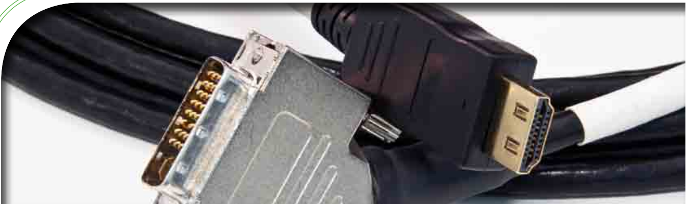
HDMI to DVI Assembly