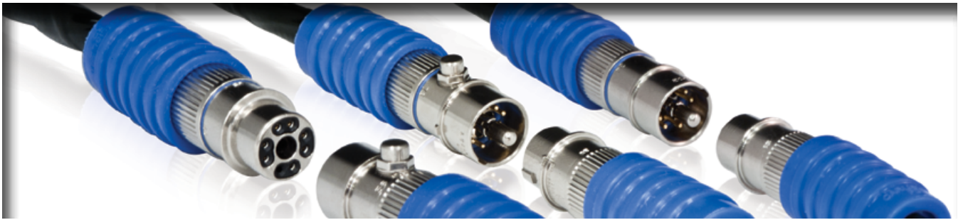
Octax™ Connectors from left to right: UHSOCTAX-8P, UHSOCTAX-8S-01, UHSOCTAX-8S-02